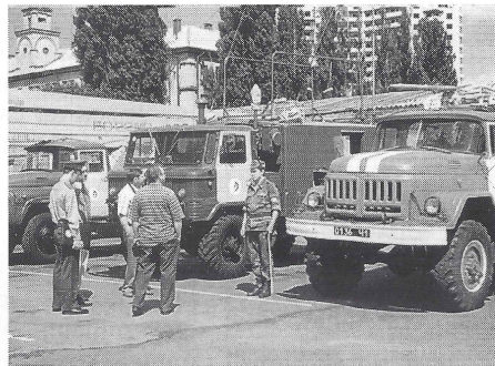
Canadian experts/trainers in emergency planning were briefed on Kyiv's Civil Defence Brigade equipment.