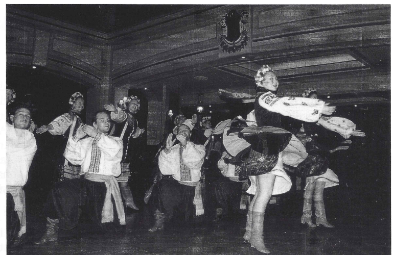
Winnipeg dance troupe Rusalka entertain Ministers and guests.