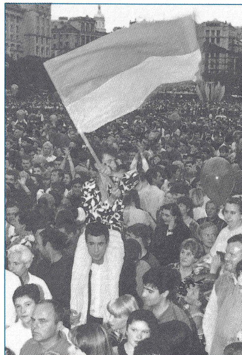
Celebrations in Kyiv's Independence Square.

During the meeting between the Canadian and Ukrainian Speakers on August 23rd, Senator Molgat noted that "there is a practical possibility to establish closer cooperation" between the lawmakers of the two nations. His Ukrainian counterpart,